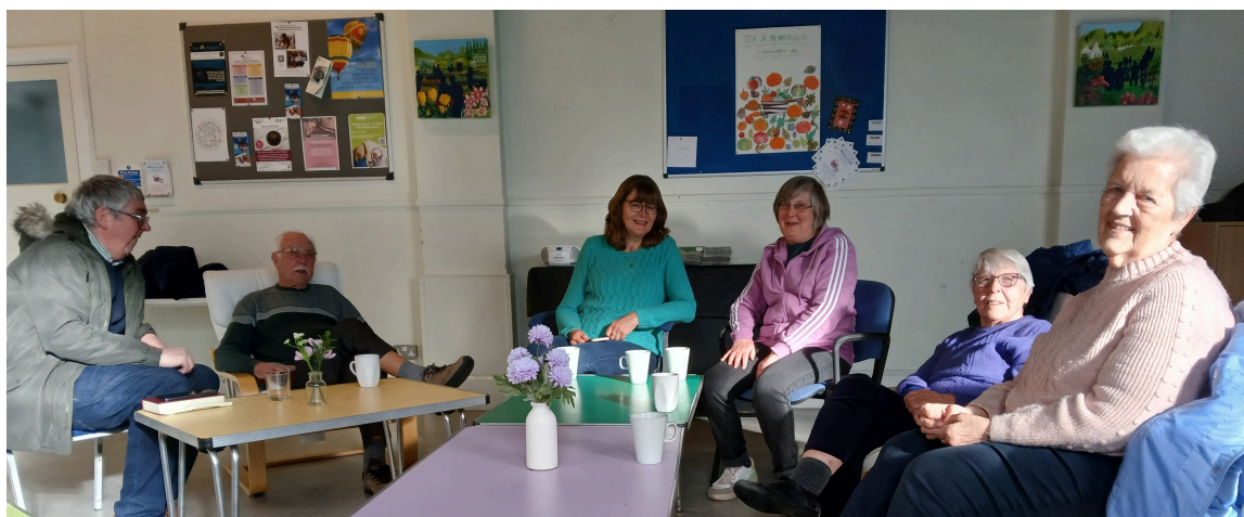
Cuppa and Company