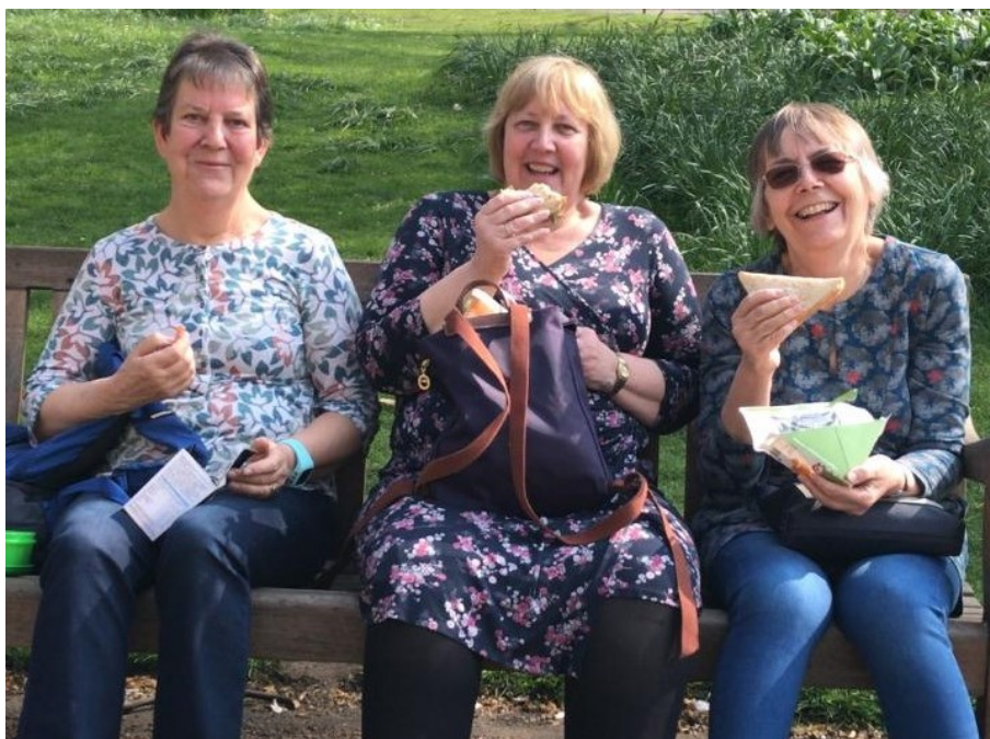
Lunch break during 2019 Woman to Woman Conference at Methodist Central Hall