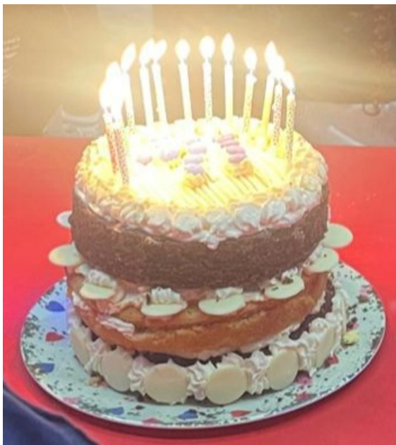
Israella's 14th birthday cake