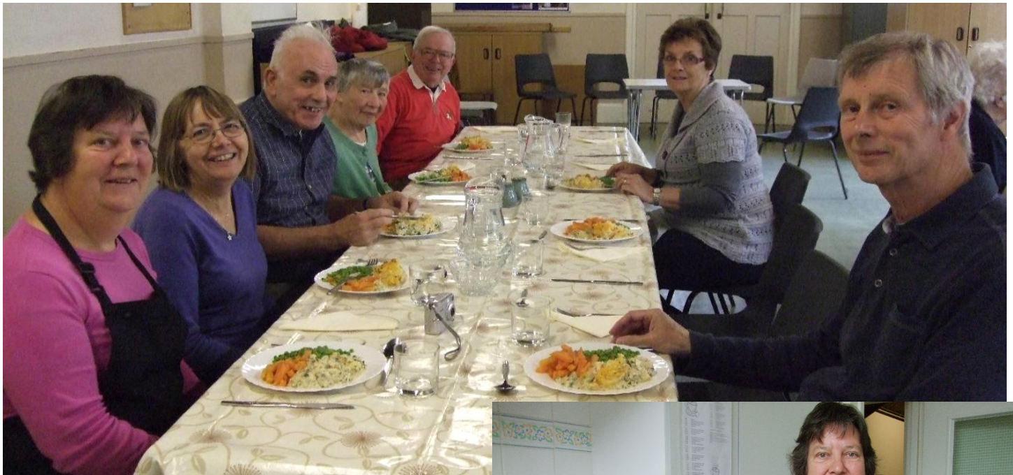
Enjoying Wendy's fish pie at Friday Focus in May 2013