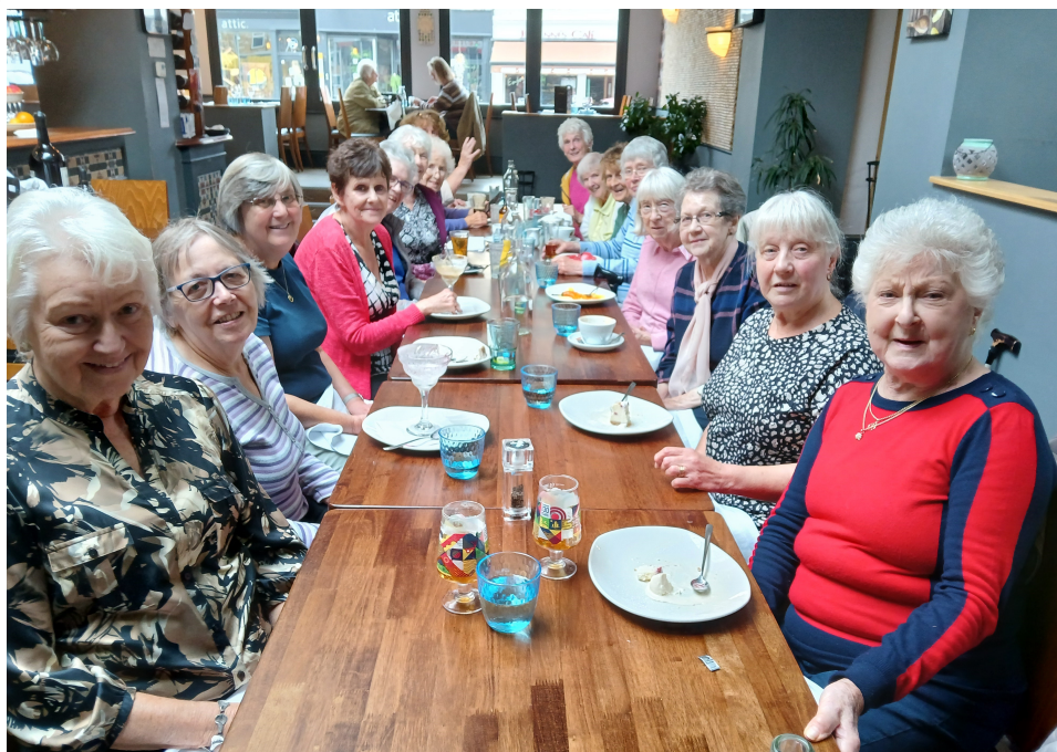
60th anniversary lunch