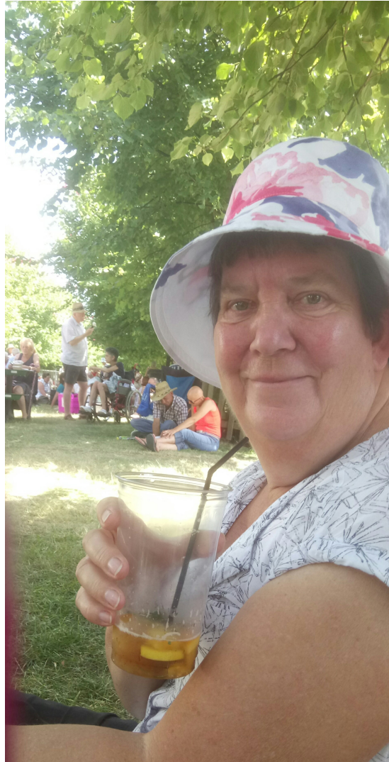
At Hampton Court Flower Show 2017

Hampton Methodist Church, Percy Road, Hampton, TW12 2JT