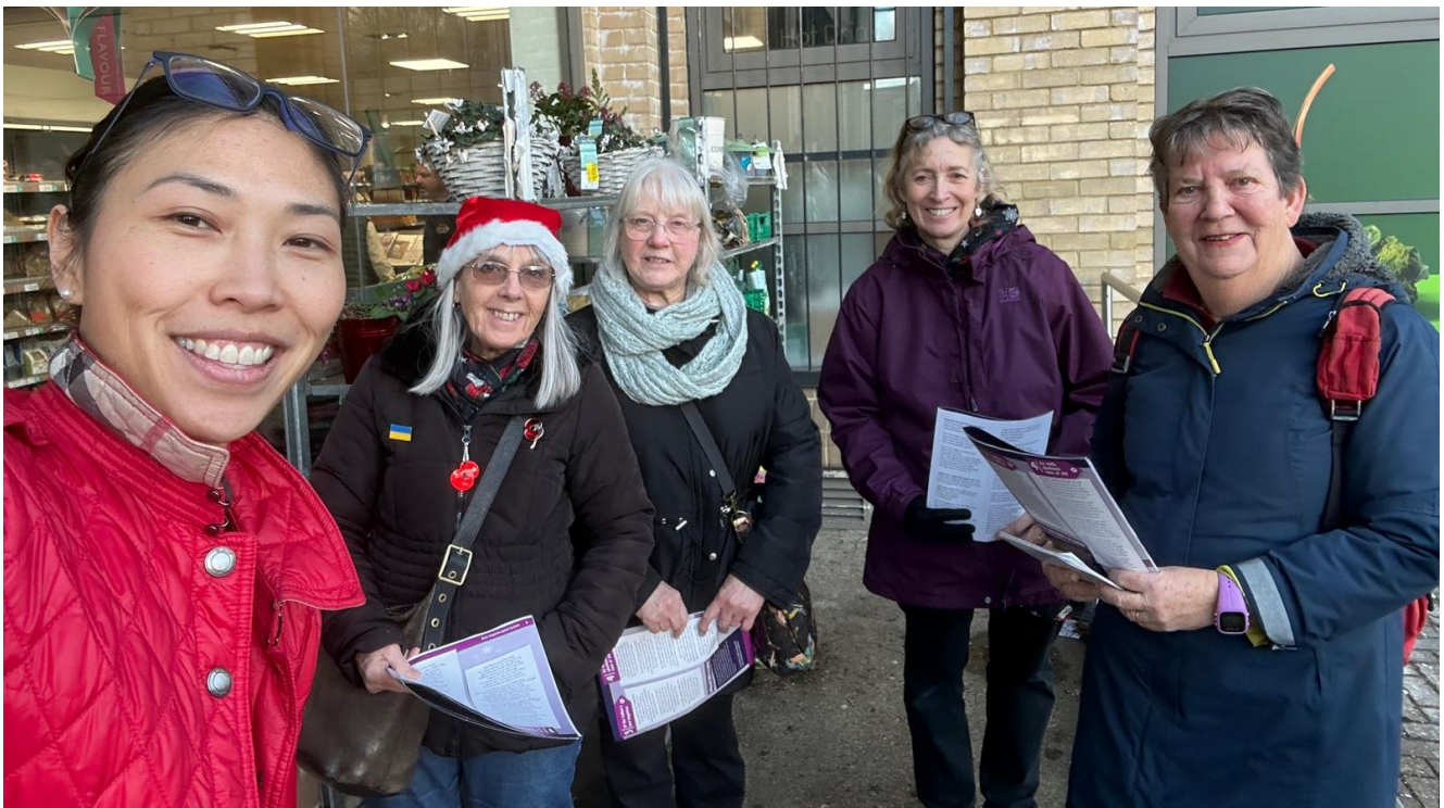
They sang carols for an hour outside Waitrose and raised £110.20 for the Extra Mile