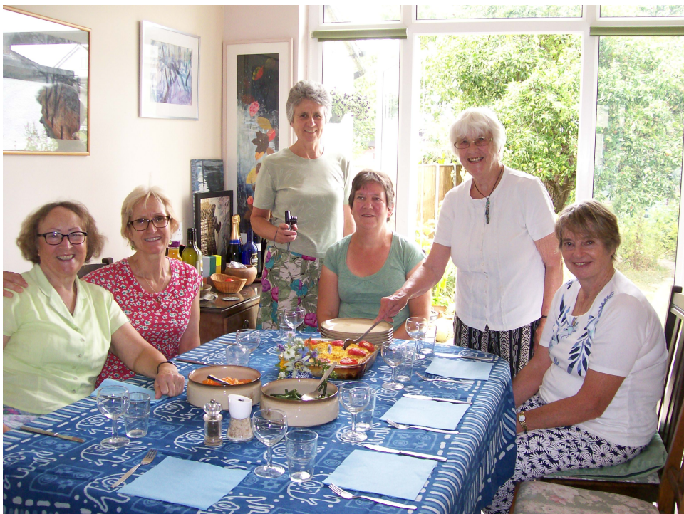
Housegroup lunch July 2015