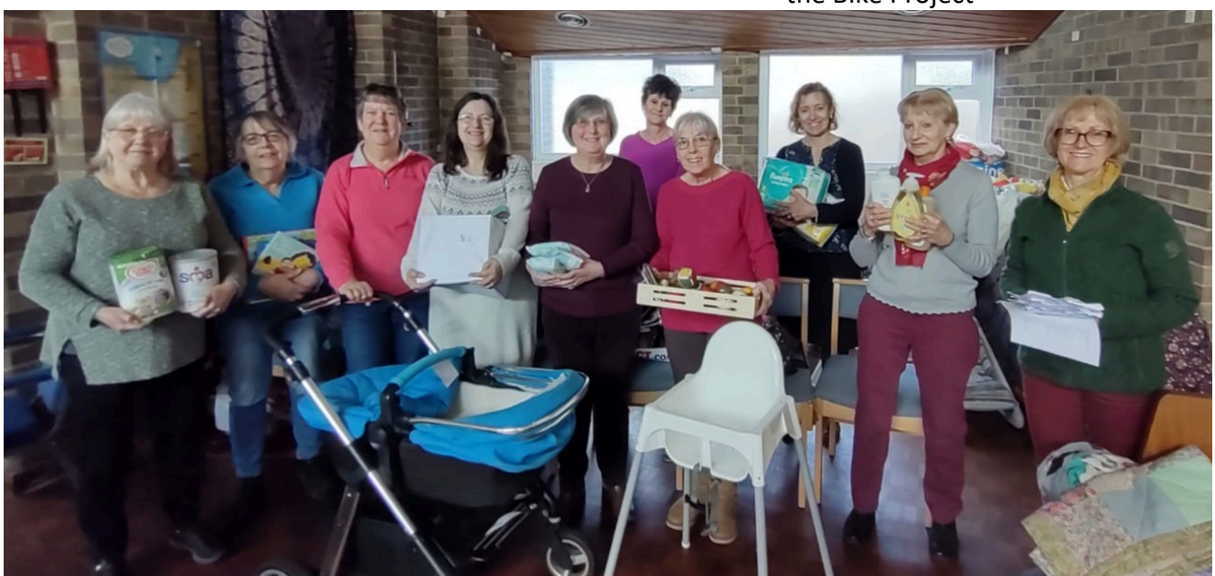
Some of the Extra Mile team