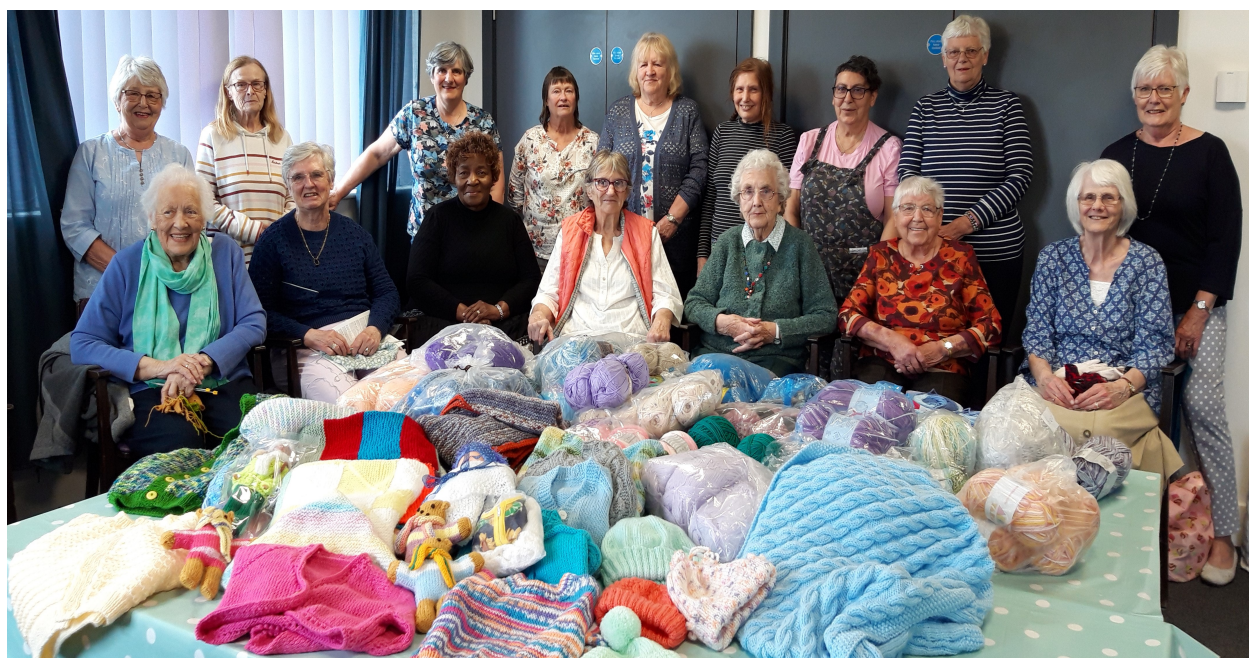
Farnham Assist Knit and Natter Group