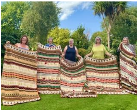
Angmering Crochet Group

Finally, as a church we decided to put together a Last Supper display and several knitters and crochet enthusiasts worked together to produce a lovely display, much admired by all who visited the church during Easter. Find out more about the Knitalongs and to sign up to the Knitalong mailing list here https://www.vic-methodist-bristol.org.uk/knitalongs/