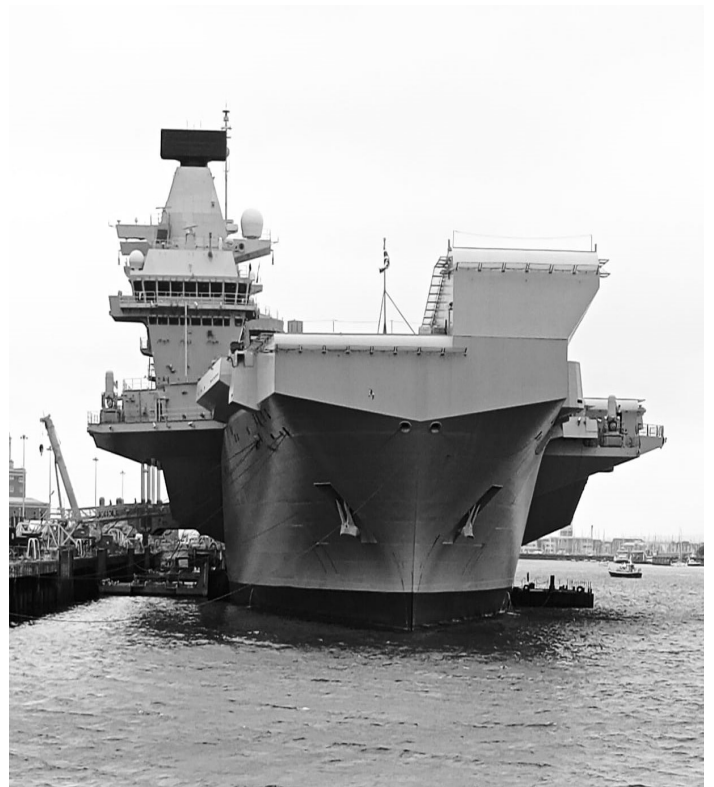
HMS Prince of Wales