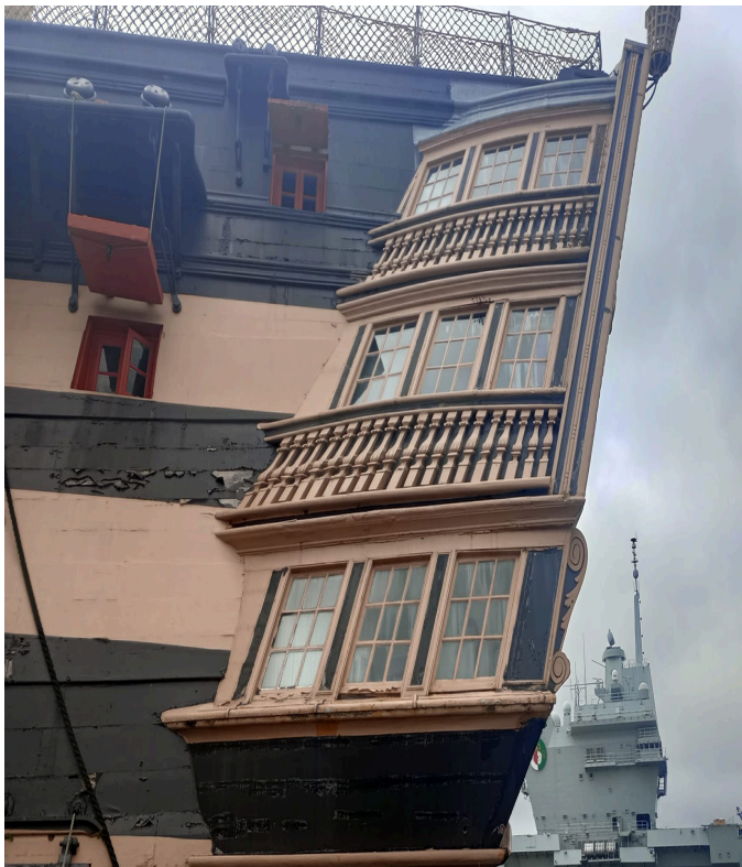
HMS Victory with HMS Queen Elizabeth behind